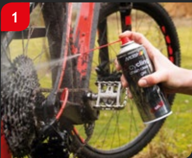
Chain Cleaner Gel