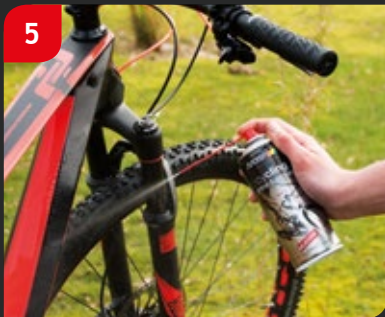
Shine en Protect